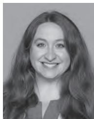
Ellen Trudell Media Contact