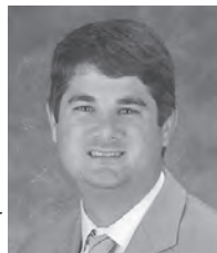
Paul Utterback Media Contact