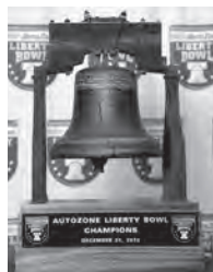
AutoZone Liberty Bowl Bell Trophy