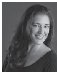
Gina Lehe Media Contact