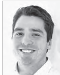
Aldo Amato Media Contact