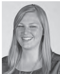
Samantha Chapuseaux Media Contact