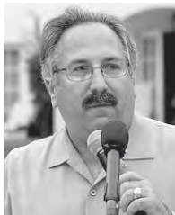
Rick Schloss Media Contact