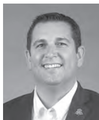
Eric Rhodes Media Contact