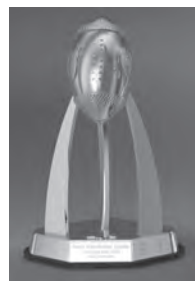
Rossi T. Ralenkotter Trophy