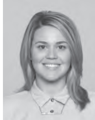
Tessa Giammona Media Contact