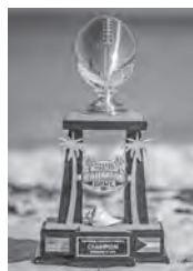
The Prime Minister's Trophy