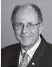
Charlie Fiss Media Contact