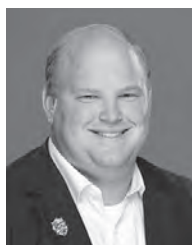
Nate Blythe Media Contact