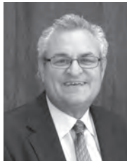
Larry Wahl Media Contact