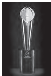
College Football Playoff National Championship Trophy