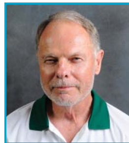
2017: Ohio Frank Solich