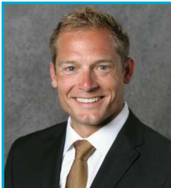
2015: Western Michigan P.J. Fleck