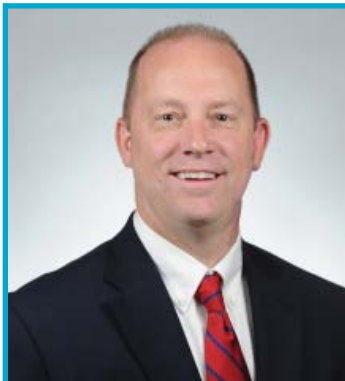
2014: WKU Jeff Brohm