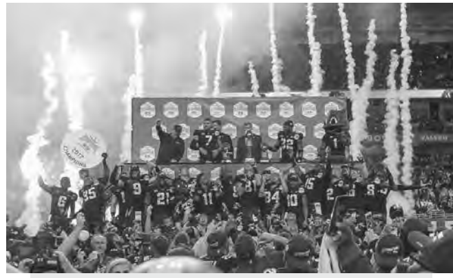
Last year's Valero Alamo Bowl produced a top-notch matchup between Stanford and TCU. The victorious Horned Frogs players and their Cardinal counterparts took in the many sights and sounds of greater San Antonio in the leadup to the prime time telecast.

The economic impact and exposure received are great benefits, but it is community pride that leads thousands to volunteer their time and services to the bowl game in their town. It is a genuine appreciation for their hometown and its offerings that generates the greatest local interest.