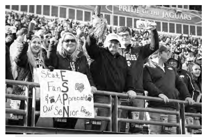
Mississippi State fans celebrate their team at last season's TaxSlayer Gator Bowl. Over 1.6 million fans attended bowl games in 2017-

on their team, another opportunity to celebrate a victory. It also offers the chance to visit a city or area they may never have visited before, or the chance to go back to a place where they built many fond memories from a previous bowl experience.