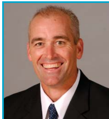
2016: Old Dominion Bobby Wilder