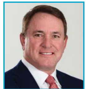
2018: FIU Butch Davis