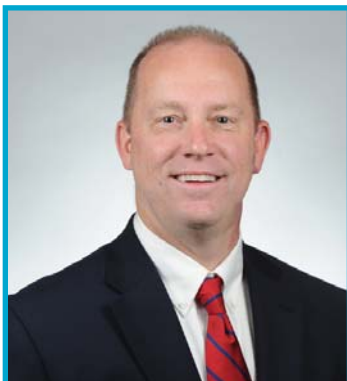
2014: WKU Jeff Brohm