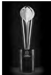
College Football Playoff National Championship Trophy