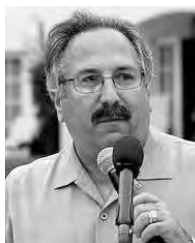
Rick Schloss Media Contact