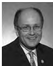
Charlie Fiss Media Contact