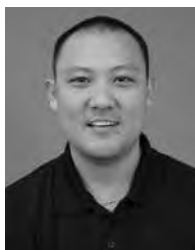
Derek Inouchi Media Contact