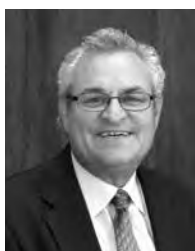
Larry Wahl Media Contact