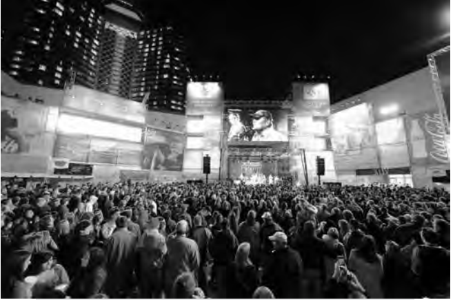
Fans flock to enjoy the Beach Boys in concert at the 2012 R+L Carriers New Orleans Bowl.

College bowl games are where everybody wins . . .