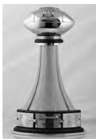
George P. Crumbley Championship Trophy