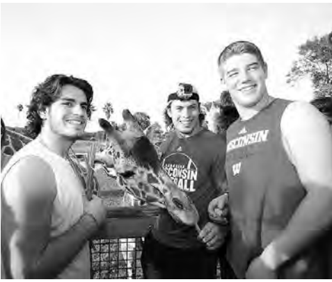
Wisconsin players get up close and personal with a friendly giraffe at Busch Gardens during activities of last year's Outback Bowl in Tampa.

"In my playing career I had the tremendous opportunity to play in three bowl games," Archie Manning, former Ole Miss quarterback and College Football Hall of Fame member, said. "I have a lot of great memories from my playing days, but looking back, the chance to spend a week experiencing a new city with all of my teammates is something that will always stand out in my mind."