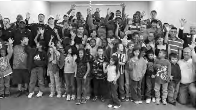
Baylor's student-athletes visited with a local youth group during activities at the Valero Alamo Bowl in San Antonio.

During bowl week in each of the bowl communities, everyone is a citizen, everyone is welcome. Everyone is home. Welcome.