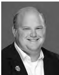
Nate Blythe Media Contact