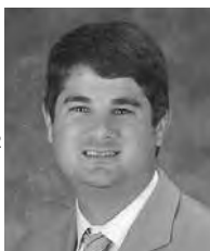
Paul Utterback Media Contact

Satellite truck parking is available at the Superdome by special pass only, and must be coordinated directly through the Superdome.