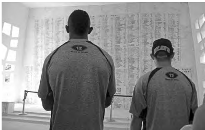
Oregon State players pause for reflection at Pearl Harbor's USS Arizona Memorial during activities at the 2013 Hawai'i Bowl.

Bowl games make champions of 41 teams, teams that end their seasons with a victory, a trophy and memories for a lifetime.