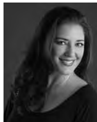
Gina Lehe Media Contact