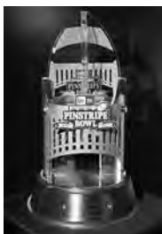
George M. Steinbrenner III Championship Trophy