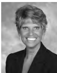
Cheri O'Neill Media Contact