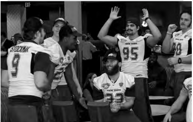
Members of the Buffalo team take part in Strikes for Spuds at the 2013 Famous Idaho Potato Bowl. The event raised money and food donations for local charities as well as charities in the two teams' hometowns.