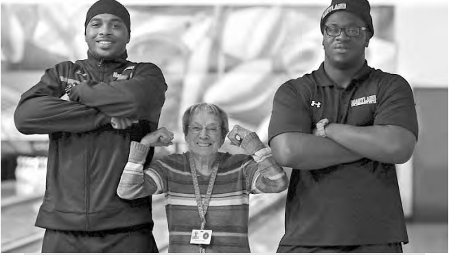
Maryland players taking part in the 2013 Military Bowl spent part of their Christmas Day bowling and visiting with veterans at the Armed Forces Retirement Home.

The economic impact and exposure received are great benefits, but it is community pride that leads thousands to volunteer their time and services to the bowl game in their town. It is a genuine appreciation for their hometown and its offerings that generates the greatest local interest.