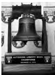
AutoZone Liberty Bowl Bell Trophy

Top 5 Crowds in Bowl Game History: 1. 63,816 2007 Mississippi State vs. UCF 2. 62,742 2009 East Carolina vs. Arkansas 3. 61,497 1991 Air Force vs. Mississippi State 4. 61,136 2016 Arkansas vs. Kansas State 5. 60,128 1989 Ole Miss vs. Air Force (all games at Liberty Bowl Memorial Stadium)