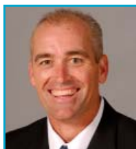
2016: Old Dominion Bobby Wilder