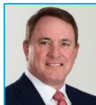
2018: FIU Butch Davis