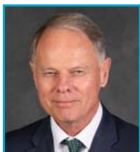
2017: Ohio Frank Solich