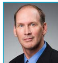
2019: Buffalo Lance Leipold