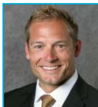
2015: Western Michigan P.J. Fleck