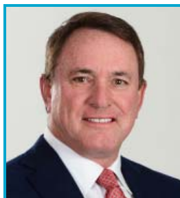
2018: FIU Butch Davis