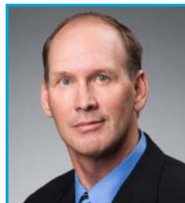
2019: Buffalo Lance Leipold