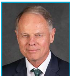
2017: Ohio Frank Solich